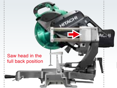
Saw head in the full back position