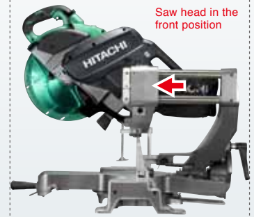
Saw head in the front position

features a fixed rail slide design that eliminates the need for rear clearance to accommodate the extension of the sliding rails. This system allows the saw to sit up against a wall or to be placed in tight work areas without compromising cutting capacity.